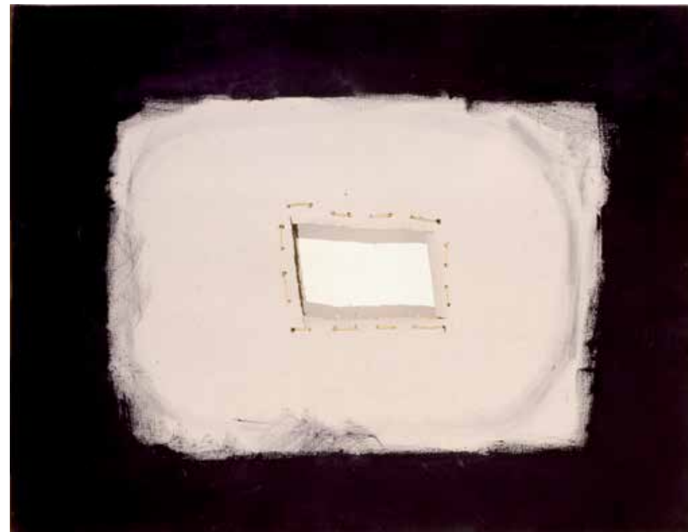
Antoni Tàpies. Violeta i forat rectangular (Violet and Rectangular Hole, 1971). Paint and assemblage on cut-out canvas. 105 × 146 cm. Collection Isabelle Maeght, Paris. © Comissió Tàpies / VEGAP, 2023.

the artwork itself. Then, in the 1980s, drawing changed once again, with Tàpies recovering the brushstroke, not to return to traditional painting, but to associate it with inscription, writing and ideograms, thanks partly to the growing influence of Chinese culture.