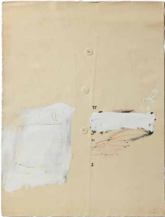
Antoni Tàpies. Botons i lletres (Buttons and Letters, 1974). Paint, wax crayon, ballpoint and relief on paper. 77 x 58 cm. Private Collection, Barcelona.

a brush – and therefore to transgress it –, from the brushstroke, which he hated so much. Partly because that was what everyone else was doing, but mostly because he preferred to work with harder tools such as pencils, burins, scissors and spatulas, which enabled him to have a more physical relationship with the surface of the work. From drawing, Tàpies went on to scratch works made of cardboard, and from there to the matter paintings. 4