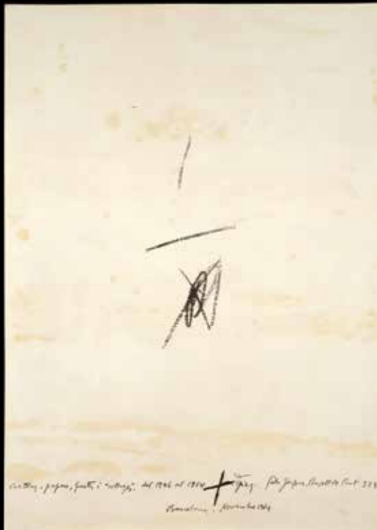
Antoni Tàpies. Tàpies. Cartons, papers, fustes i collages del 1946 al 1964 , 1964. 77 x 55 cm. Poster to announce the exhibition at the Sala Gaspar, Barcelona (November 1964). © Comissió Tàpies / VEGAP, 2023.

Tàpies' early works were essentially drawings and cardboards, and he never gave up working with paper, even when his attention was mainly focused on the so-called matter paintings. While normally associated with academic training, drawing allowed Tàpies to dissociate himself from the traditional practice of painting with