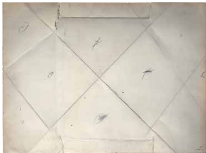
Antoni Tàpies. Paper amb plecs i signes (Paper with Folds and Signs, 1964). Pencil on folded and torn paper. 50 × 68 cm. Fundació Antoni Tàpies, Barcelona. © Fundació Antoni Tàpies / VEGAP, 2023.

Paper, cardboard and collage were already there at the beginning of Tàpies' artistic practice, especially in the works made from 1946 to 1947, when the artist was in his early twenties, but it was not until 1958 when the use of these materials became increasingly important, alongside the famous matter paintings. Under the influence of Marcel Duchamp and Kurt Schwitters, Tàpies experienced at that time 'the necessity of insisting on and going deeper into that message of the insignificant, of things worn out, dramatised by time.' 9 Why then precisely? In the late 1950s, on both sides of the Atlantic, a new generation of artists was reacting against the hegemony of Informalism and Abstract Expressionism and looking for new ways of representing reality. The use of new materials, of collage and assemblage, became fairly generalised and in 1960 the landmark exhibition New Forms, New Media was held at the Martha Jackson Gallery, New York, 10 with the participation of around seventy artists, Tàpies among them. The aim was to reflect the substantial changes that were taking place in the art world, and which would soon explode with the arrival of Pop Art, performance and Minimalism. In Tàpies' works of the 1960s and 70s, drawing is very closely linked to collage, assemblage, grattage, tearing, folding and manipulating materials to put them at the centre of