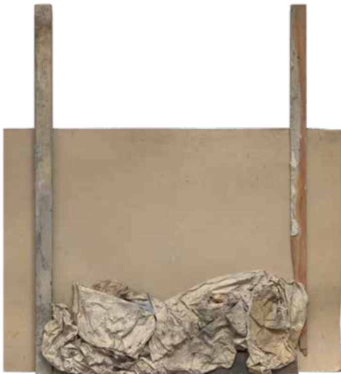
Antoni Tàpies. Cartó, fustes i draps (Cardboard, Wood and Cloths, 1973). Assemblage on cardboard. 114 x 105 cm. Collection Adrien Maeght, Saint Paul de Vence. © Comissió Tàpies / VEGAP, 2023.

established with the artist's book El pa a la barca , jointly created by Joan Brossa and Antoni Tàpies. Published in 1963 by Sala Gaspar, the book combines Brossa's ironic text (with its bureaucratic, journalistic, academic, ordinary tone) with the poor materials chosen by Tàpies (a wrinkled piece of paper with two black stains, a page from a notebook, a torn and stained newspaper cutting, a fragment from an envelope). In line with the type of works featured in this exhibition, it stands against the preciousness of the traditional illustrated book conceived as a luxury object. 11